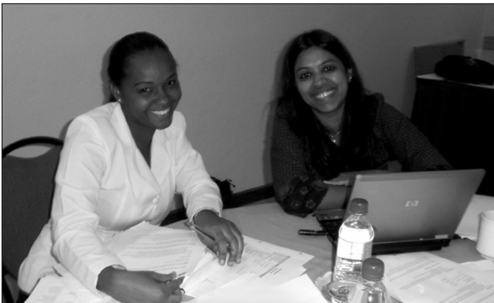
Participants in the IDI/CAROSAI design meeting.

A Program on Risk-based Approach to Financial Auditing was launched in 2010 to follow up on the Program on Quality Assurance in Financial Auditing delivered in 2009. Audit teams from six CAROSAI members participated in developing guidelines for risk-based financial audits and carried out pilot audits based on the guidelines. The program culminated with an IDI/CAROSAI guide, A Risk-Based Approach to Financial Auditing . In 2011, the program will be delivered again for those CAROSAI members that were not able to participate in the first round. IDI staff and regional experts met for a design meeting in July 2011 to develop comprehensive courseware, which will be used to deliver a workshop on a risk-based approach to financial audits by the end of 2011.