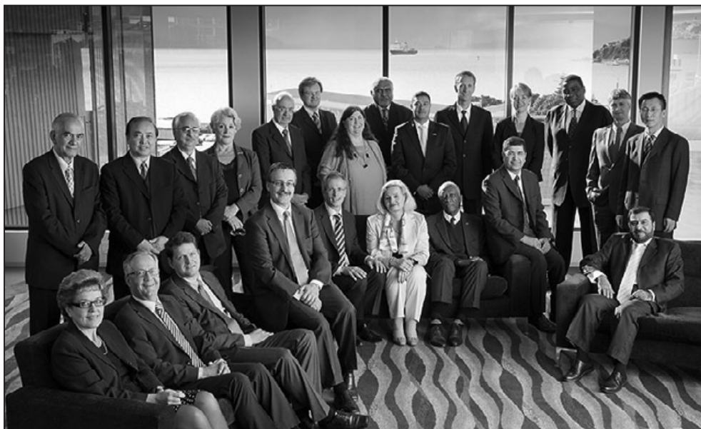
Participants in the June 2011 PSC Steering Committee meeting in New Zealand.