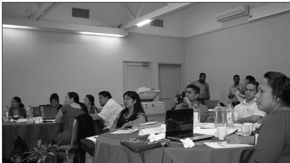
Participants at the IDI/PASAI cooperative audits on fisheries planning meeting.

IDI has agreed to support PASAI in delivering a third cooperative audit focusing on fisheries after the successful completion of two cooperative audits on solid waste management and access to safe drinking water. Team members from the participating SAIs held an audit planning meeting in August 2011 and are to conduct field audits, analyze data, and draft audit reports before reconvening for a feedback meeting early in 2012.