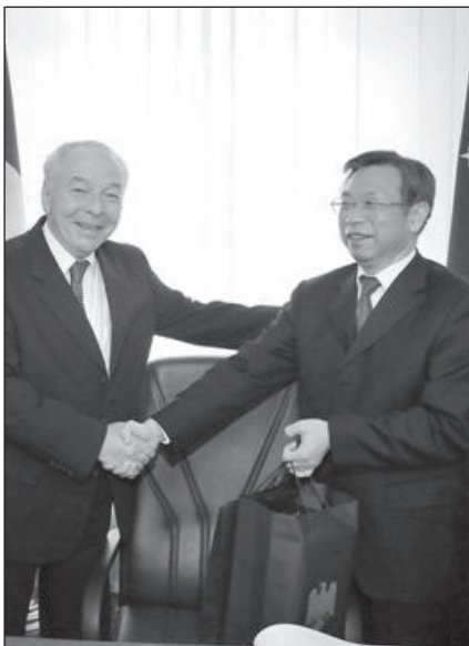
Nicolae Vacaroiu (left), President of the Romanian Court of Accounts, and Liu Jiayi (right), Auditor General of the China National Audit Office, agreed to renew the bilateral agreement between their SAIs during their July meeting in Bucharest.

Liu Jiayi, Auditor General of China, led a Chinese delegation that visited the RCoA July 19–21. As a result of their meeting, the heads of the two SAIs agreed to renew the bilateral cooperation agreement between their SAIs that was originally signed in 2004. After the agreement is updated and finalized, it will be officially signed in Beijing.