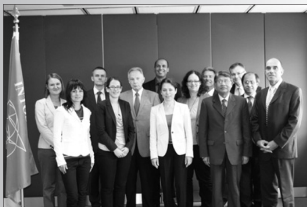
Members of the INTOSAI subcommittee on peer review.

INTOSAI's peer review efforts are coordinated by subcommittee 3 of the Capacity Building Committee. The Journal wishes to express its appreciation to the subcommittee, chaired by the SAI of Germany, for its invaluable assistance in preparing this issue.