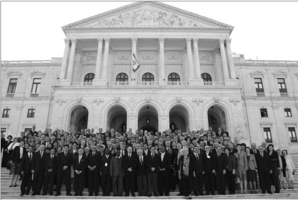
Participants in the VIII EUROSAI Congress in Lisbon.

The presentations of congress speakers also contributed to fruitful debates, which were, in turn, enriched by participant interactions. The participants included representatives of 47 EUROSAI member SAIs and 20 observers from the public audit community (including other representatives of INTOSAI and its regional organizations). All had the opportunity to discuss issues of common interest and major importance that were raised in the context of the congress themes.