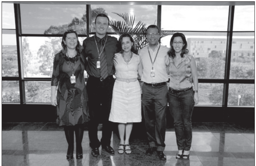
Course instructors for the Brazilian e-learning course on performance auditing.

E-mail: arint@tcu.gov.br Web site: www.tcu.gov.br