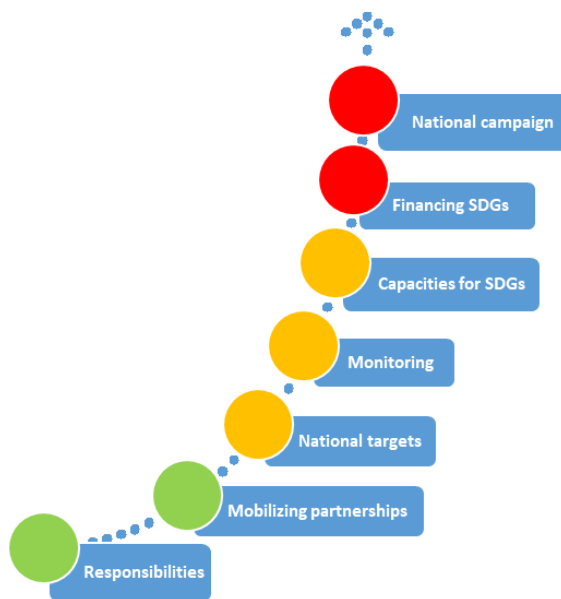
Figure 1 SDGs semaphore of preparedness for implementation of SDGs in SR

The audit results are illustrated by the colours of the semaphore: