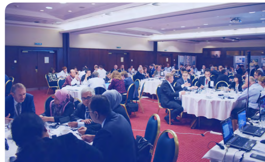
Peer Review conference - June 2018