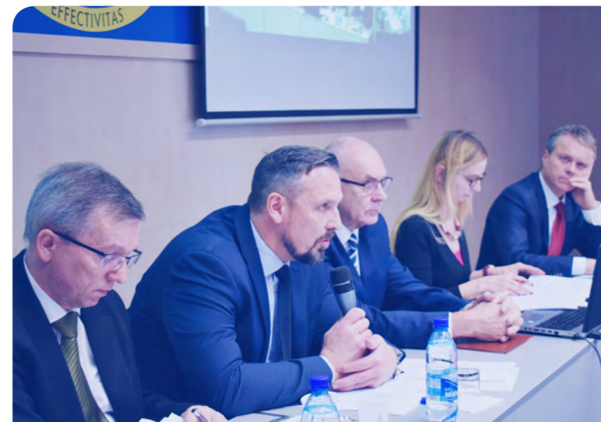
Assessing the Memorandum on Cooperation with the Attorney General and the Ministry of Interior of the Slovak Republic