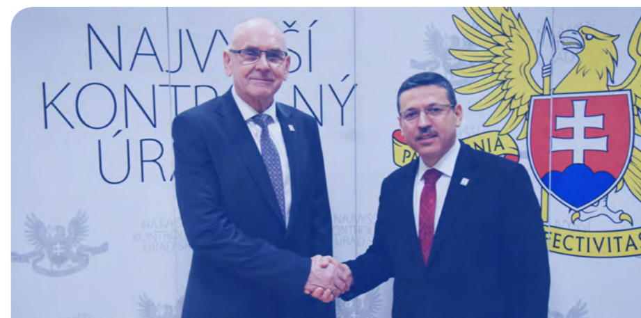
Visit by Seyit Ahmet Baş, the President of EUROSAI and SAI of Turkey – April 2019