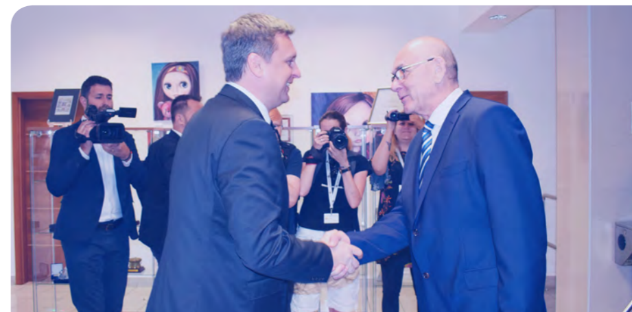
Visit by Andrej Danko, the National Council of the Slovak Republic Chair – May 2018

Bratislava meeting of the INTOSAI global working group targeting the sustainable financing of the public administration and support of public policies in social and pension systems, health and education