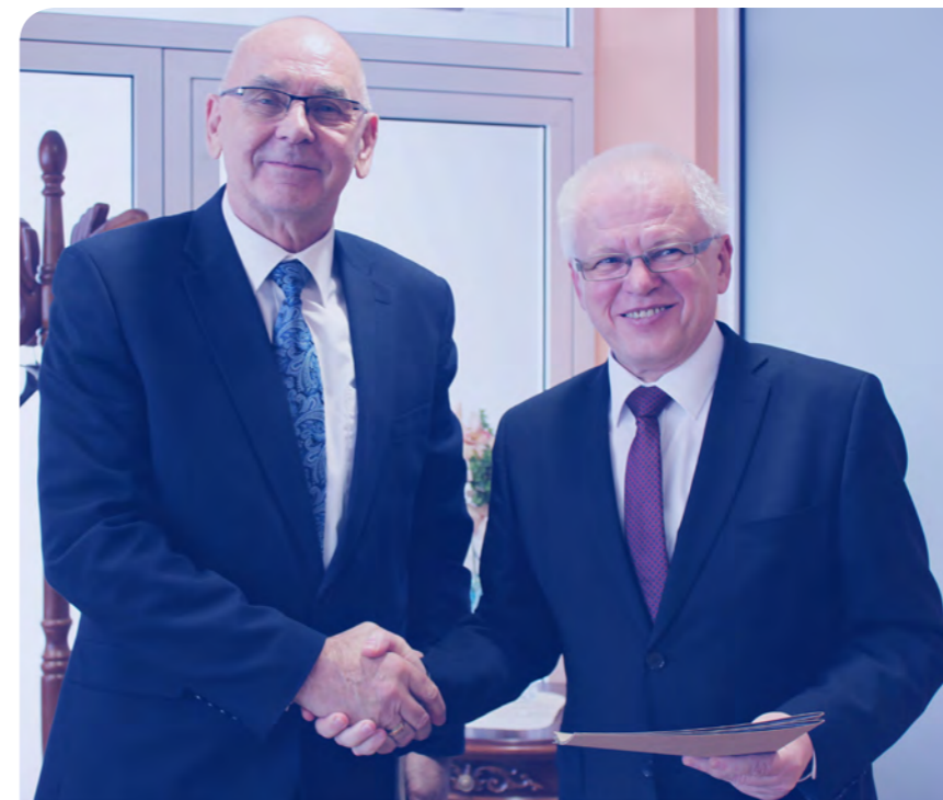
Signing the Memorandum with the University of Economics in Bratislava