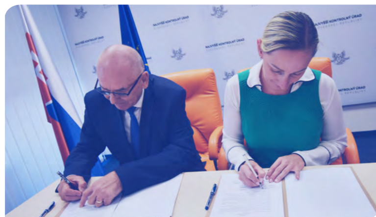
Signing the Memorandum on Cooperation with the Faculty of Social and Economic Science of the Comenius University October 2018