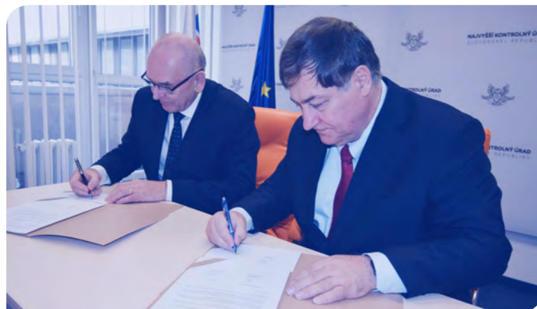
Signing the Memorandum on Cooperation with the Centre for Science and Technical Information December 2018

It is one of the ways to combine forces to multiple views into one goal, to offer recommendations to auditees that can not only take effective action, but also model systemic changes for support public policy sustainability and economy in public finance management.