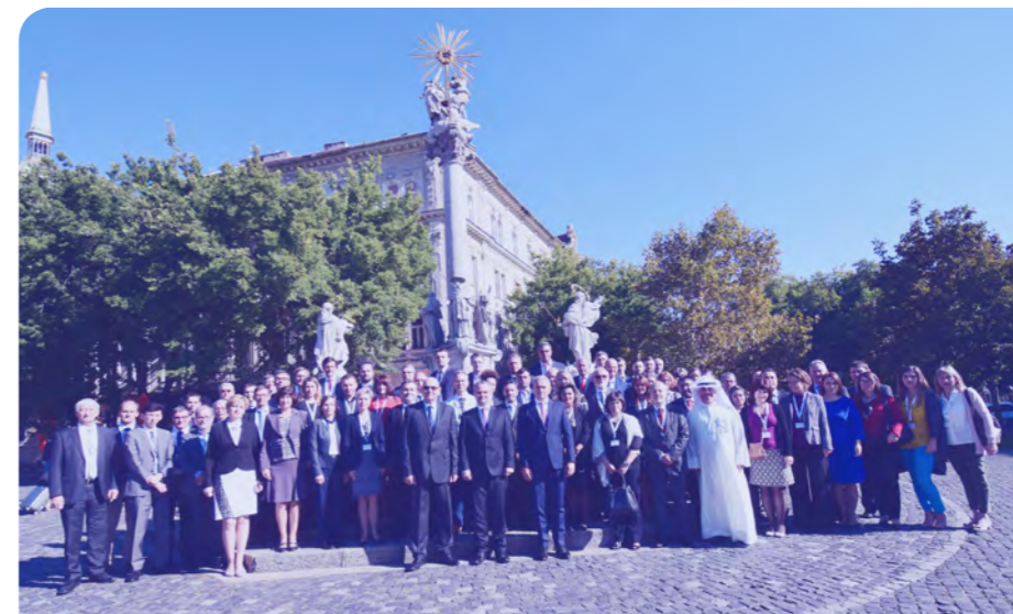
Working Group for Environmental Audits - September 2018