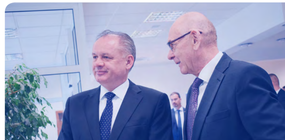
Visit by Andrej Kiska, the Slovak Republic President – March 2018