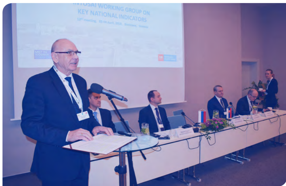
Working Group for National Indicators - April 2019

International activities and know-how exchange at an international level contribute to the development of methodologies and the quality of work and thus towards improved implementation of the Slovak SAO's mandate for the benefit of citizens and the society.