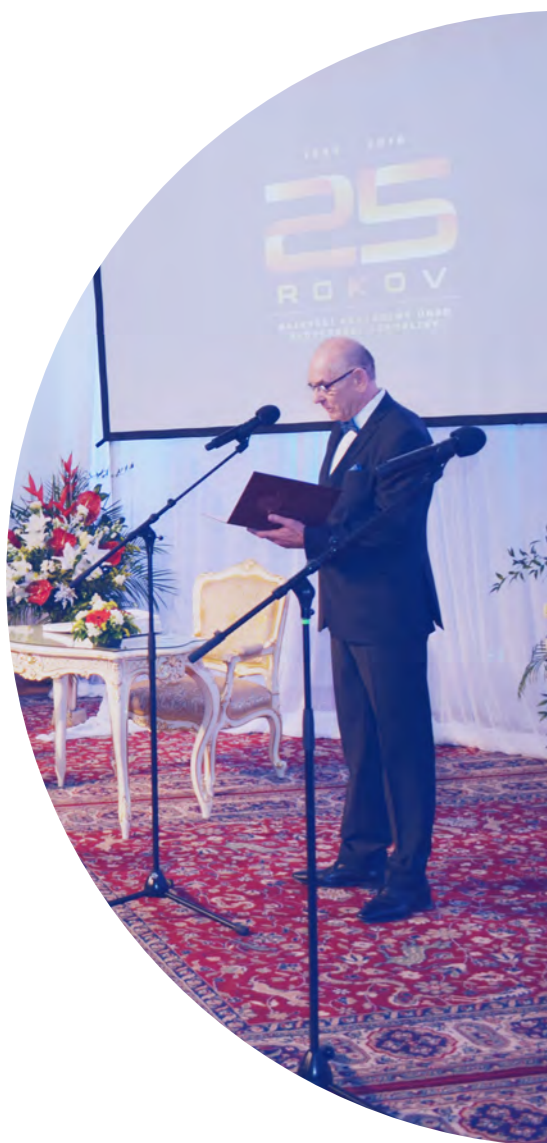
Celebrations of the 25 th anniversary of the SAO SR establishment - April 2018

The Supreme Audit Office of the Slovak Republic is an independent State body that audits the management of the funds and property of the State, local authorities and the European Union. Its status and scope is stipulated by articles 60-63 of the Constitution and Act no 39/1993 Coll. on the Supreme Audit Office of the Slovak Republic. Its audit activities are carried out by a resolution of the National Council and according to its own schedule of audit activities. Similar audit institutions operate in almost all countries in the world, yet even within the European Union itself, there is no common model.