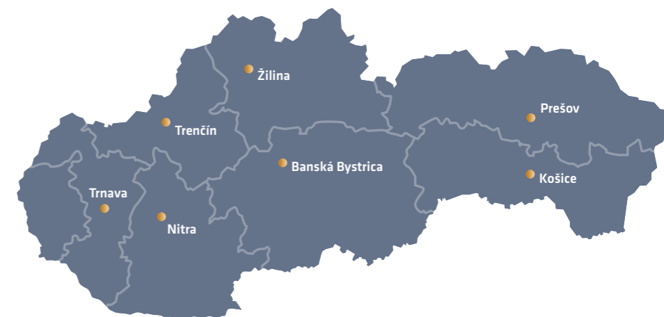
AUDIT RESULTS IN MUNICIPALITIES