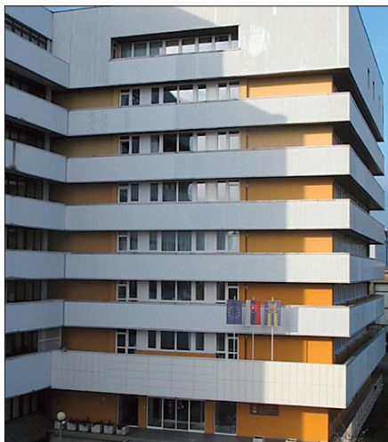
Supreme Audit Office of the SR

Supreme Audit Office of the Slovak Republic, Regional Office SAO SR Banská Bystrica, Regional Office SAO SR Bratislava, Regional Office SAO SR Košice, Regional Office SAO SR Nitra, Regional Office SAO SR Prešov, Regional Office SAO SR Trenčín, Regional Office SAO SR Trnava, Regional Office SAO SR Žilina