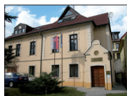
Regional Office SAO Banská Bystrica