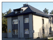
Regional Office SAO Košice