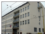
Regional Office SAO Žilina