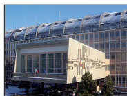
Regional Office SAO Trnava