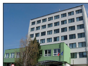
Regional Office SAO Nitra