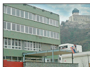
Regional Office SAO Trenčín