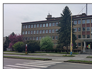
Regional Office SAO Prešov