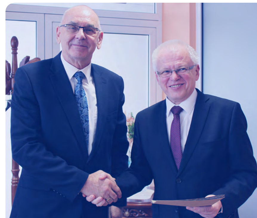
Signing the Memorandum with the University of Economics in Bratislava