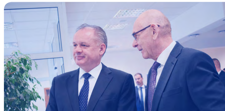
Visit by Andrej Kiska, the Slovak Republic President – March 2018