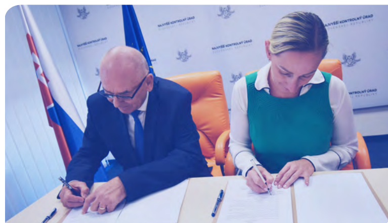
Signing the Memorandum on Cooperation with the Faculty of Social and Economic Science of the Comenius University October 2018