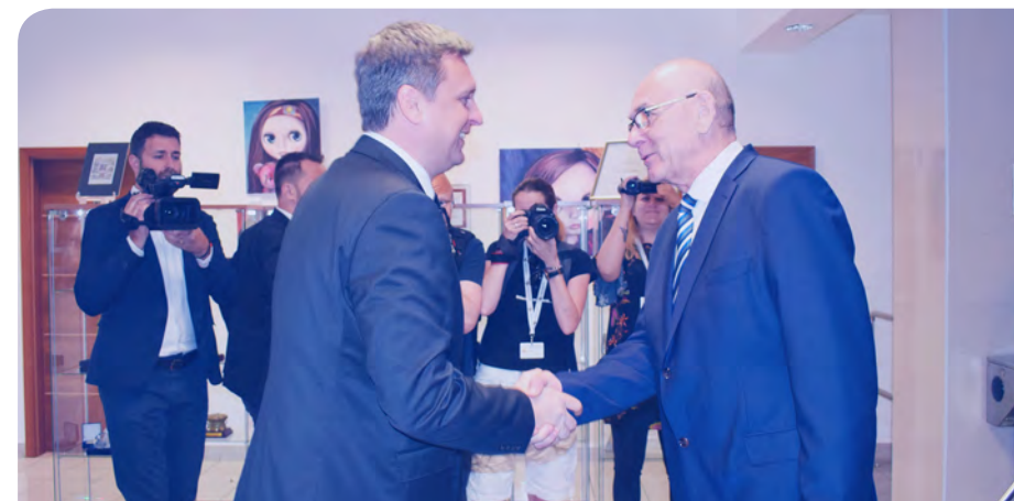
Visit by Andrej Danko, the National Council of the Slovak Republic Chair – May 2018

Bratislava meeting of the INTOSAI global working group targeting the sustainable financing of the public administration and support of public policies in social and pension systems, health and education