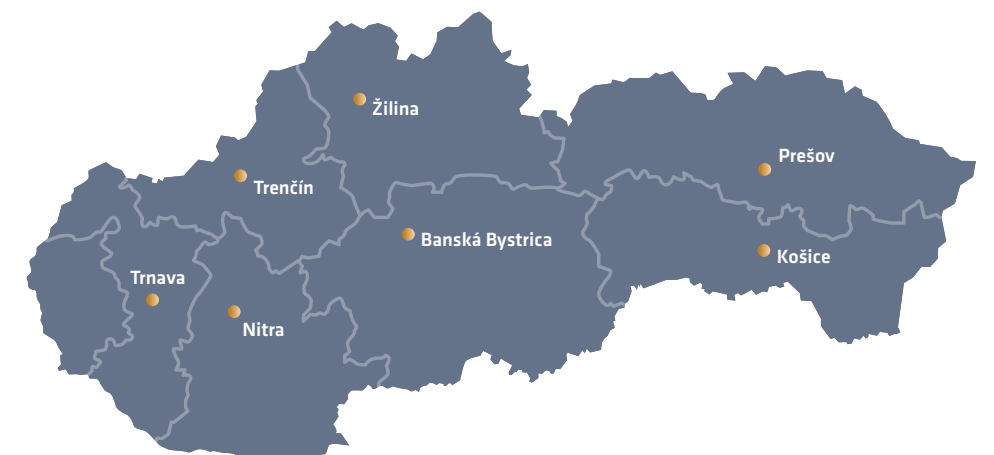
AUDIT RESULTS IN MUNICIPALITIES